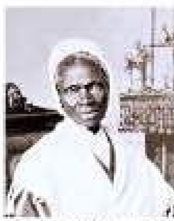
Sojourner Truth about 1870

Sojourner Truth was born into slavery in New York around 1797. Her birth name was Isabella Baumfree. She changed it to Sojourner Truth in 1843. She suffered under several owners before she finally escaped to freedom in 1825. She became a widely admired abolitionist and feminist. Below is a passage from her autobiography from 1875.